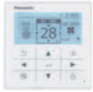
Optional Controller Wired remote controller CZ-RTC5