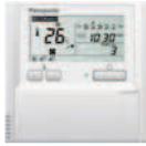
Optional Controller Timer remote controller CZ-RTC4